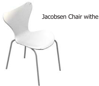
Jacobsen Chair with