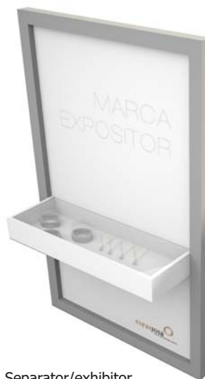
Separator/exhibitor panel display half B (103x220cm height). With light.