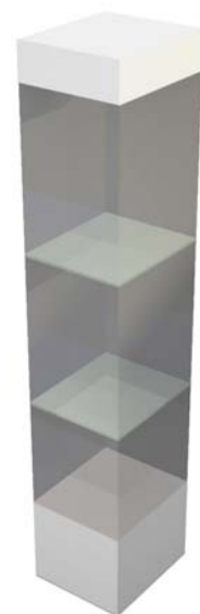
Verical wooden cabinet display (37x43x200cm height). With light.