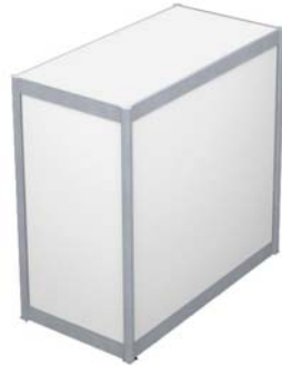
Aluminium Counter (103x53,5x100 cm height)