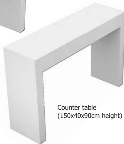
Counter table (150x40x90cm height)