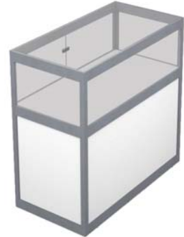
Aluminium cabinet countertop display. (103x53,5x100 cm altura). No light.