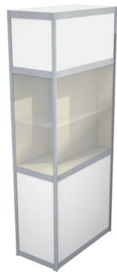
Aluminium cabinet XL (103x53,5x248cm height). With light.