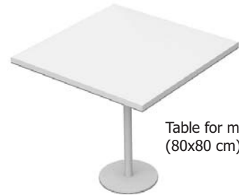
Table for meeting (80x80 cm)