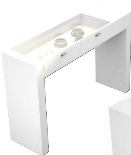
Cabinet countertop display (150x40x90cm altura). With light.