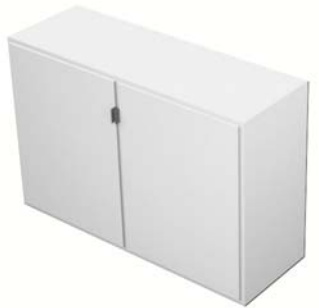
Aluminium storage cabinet (103x53,5x100 cm height)