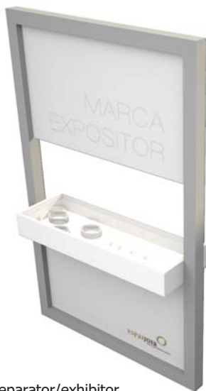
Separator/exhibitor panel display big A (103x220cm height). With light.